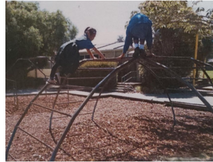
Play in the playground.