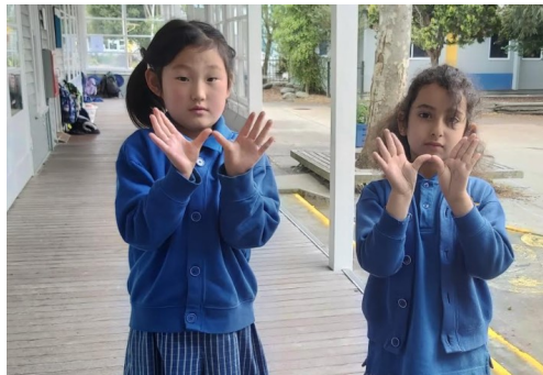
Making this sign with your hands means "I need a drink of water".