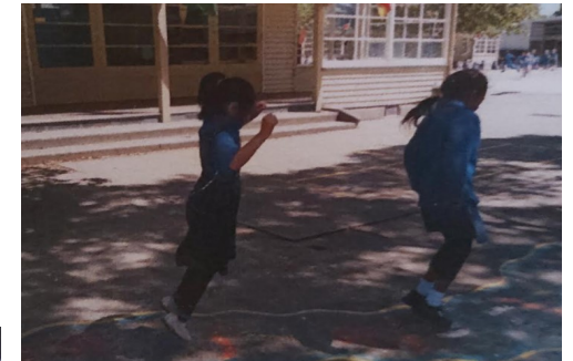
Play on the games on the concrete.