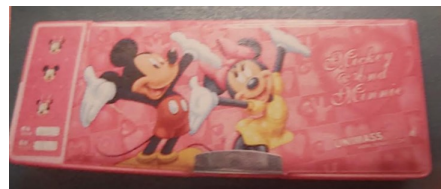
My pencil case