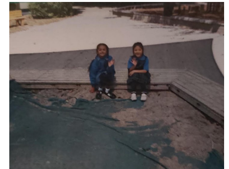
Play in the sandpit.