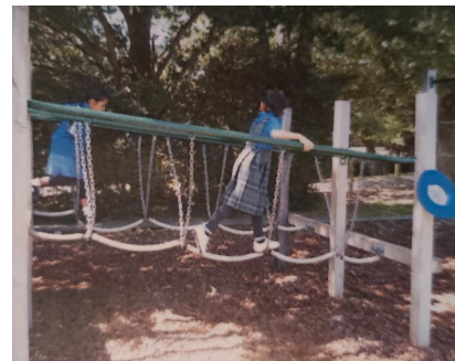
Play on the fitness course.