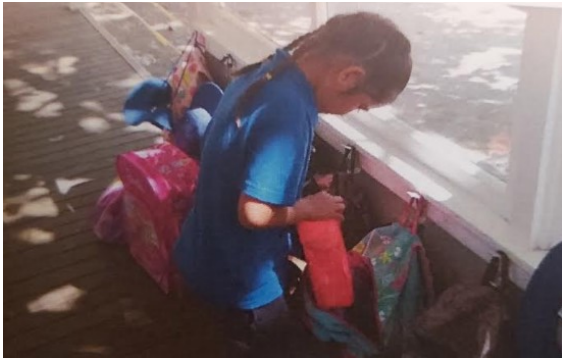
We put our lunch boxes back into our bags.