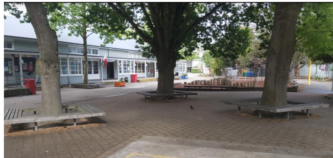
Places to sit at lunchtime