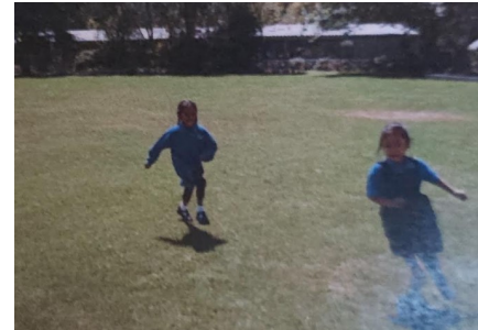
Play on the field.