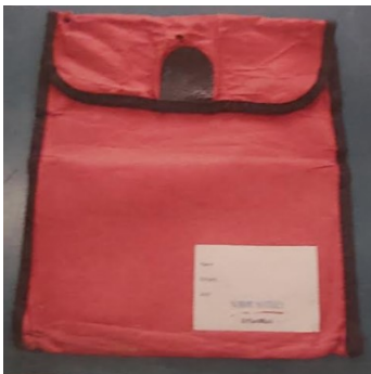
My reading folder