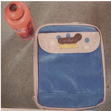
My lunch box and drink bottle